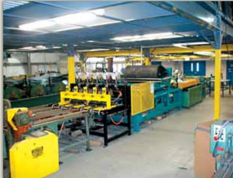
The complete coil line with the new equipment installed is 7 feet shorter than before the new equipment was added.

They chose an extruded adhesive system from Iowa Precision Industries and a Power Pinner 50 welder made by Gripnail Corp.