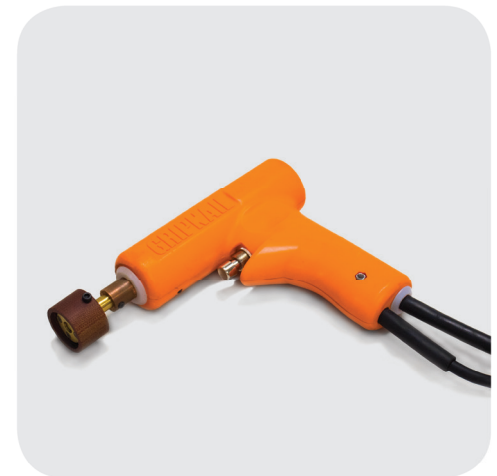
GRIPNAIL's ergonomic and simplistic pistol grip weld gun allows accurate and precise welding.